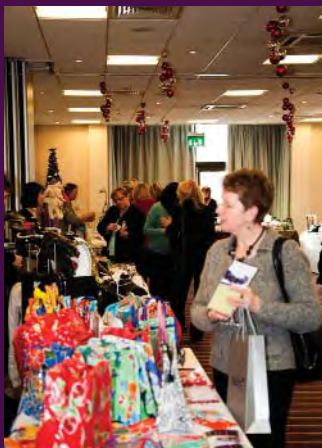
WIB NI Christmas Market